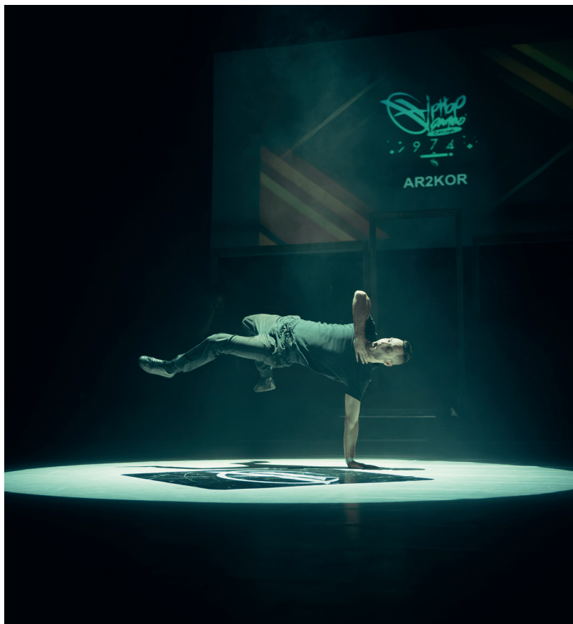
↑ Hip-Hop Games Art-Track Co

behind the scenes after studying philosophy and cinema in Paris. In the 1980s, he made his first short films, including Carne . A few years later, he embarked on an adventure in feature films, in particular, Irreversible (2002) with Vincent Cassel and Monica Bellucci.